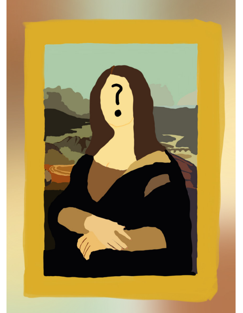
Sonia Singhal '24/THE LAWRENCE

to the past, people can freely express their voices through art, and viewers are encouraged to take their own perspectives. Such an environment has changed people's perceptions of art by allowing viewers to be more